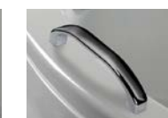
chrome handle ZnAl 325 mm