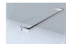
Railing 500 mm long in chrome or matt black.

Railing and railing with a shelf - only available with PIII/ALTIa, PIV/ALTIa and PT/ALTIa Walk-In shower enclosures. Options have to be ordered together with shower enclosure.