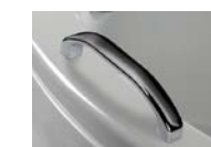
chrome handle ZnAl 225 mm