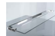
Railing with a glass shelf. Chrome or black matt railing.