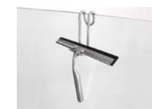
Water squeegee with hanger in shiny silver color.