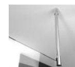
vertical stabilizer (installed to the ceiling) recommended for Walk-in shower enclosures from series: TX5b, Free Line II and Space Wall in shiny silver and matt black color